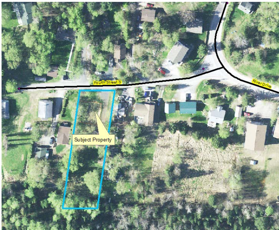
Figure 1- Aerial Photograph of the subject property.

Future development of the property will be subject to Site Plan Control and/or Development Agreements as required, which may require further planning and detailed technical studies.