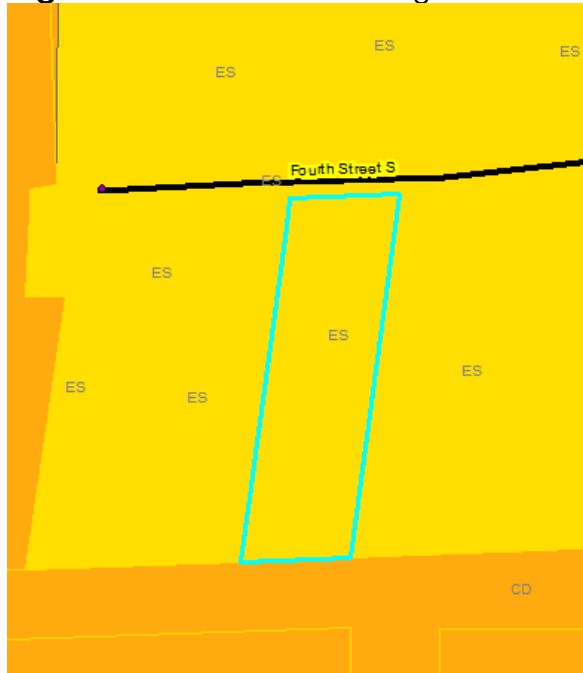
Figure 4- Official Plan Designation- Established Area

The Land Use Designation of the property is Established Area 'ES'. An image of the zoning is shown below as well as following policies with particular relevance.