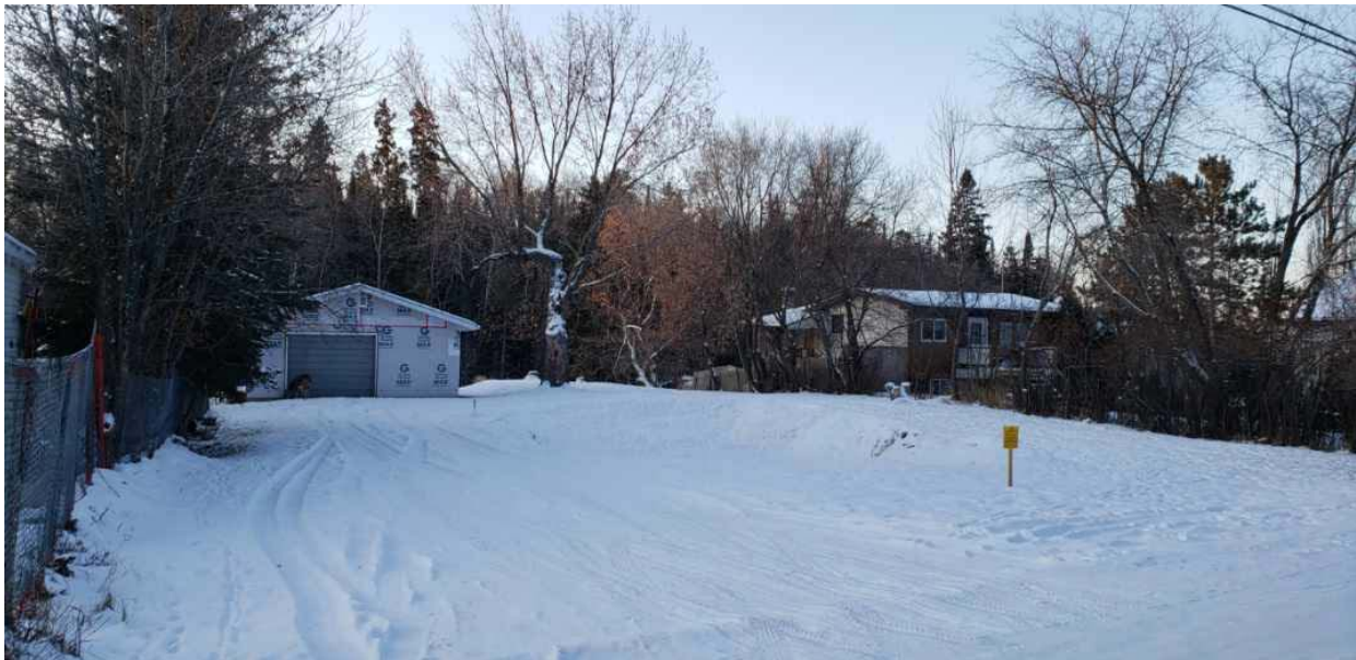
Photo 2- The south property line inclines in topography, these lands are municipally owned, vacant and well treed.