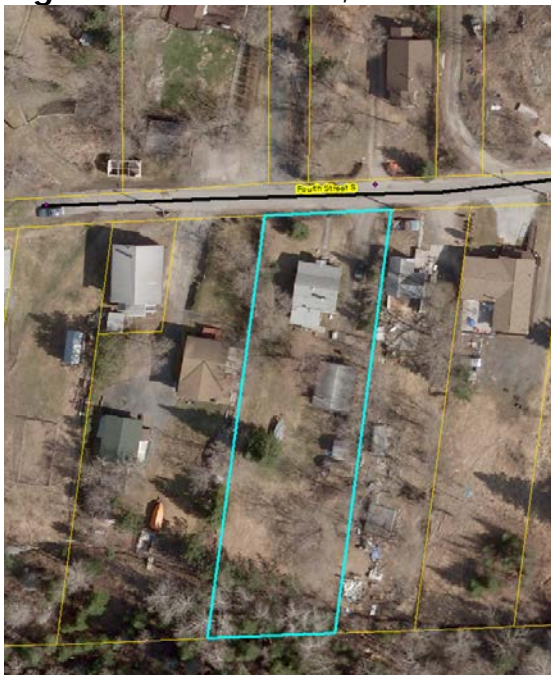
Figure 2 - Aerial Photo, 2009

The subject property is fully serviced; water, wastewater, hydro, gas. As a result of internal comments it was identified that Municipal water mains run through the property, described below as Part 1, Part 2 and Part 3, illustrated in Figure 3 - Municipal Water Mains