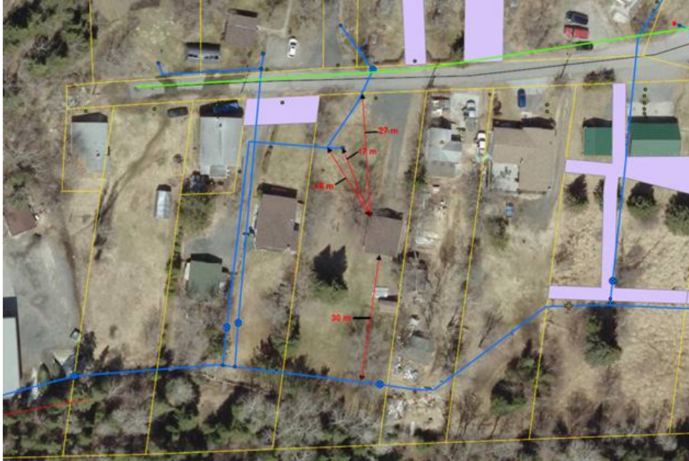
Figure 3- Municipal Water Mains.